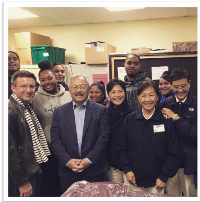
Opening of Interfaith Winter Shelter Season (November 19, 2017)

We are grateful for your presence here today and hope that this experience will inspire you to participate in the many important activities of the San Francisco Interfaith Council.