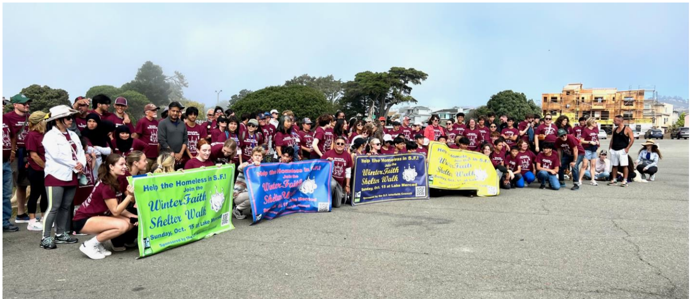
A moment of light and hope that broke all records! 200 walkers (mostly students) raised $30,000 for the San Francisco Interfaith Council's Interfaith Winter Shelter on October 15, 2023!

We are grateful for your presence here today and hope that this experience will inspire you to participate in the many important activities of the San Francisco Interfaith Council.